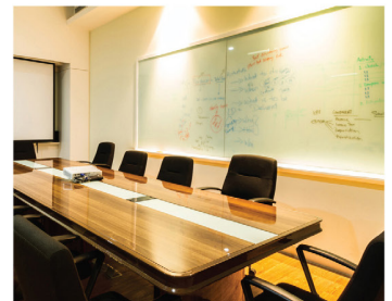
Ordinary Clear Glass