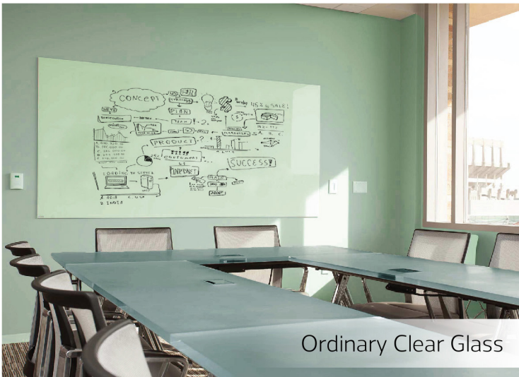
Ordinary Clear Glass

VitroKote Glassboards are easy-to-install whichever the design of your choice is. For perfect seamless installations, the industry standard is to use Gunther Ultra/Bond Mirror Mastic® and Sekisui Double Adhesive Tape . Moreover, VitroKote Glassboards can also be fabricated with holes for installation with stainless steel standoffs.